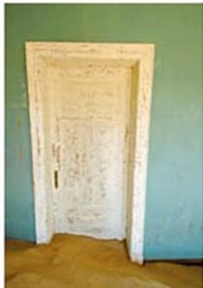
Interesting paint effect – Kolmanskop.