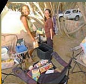
Well-prepared for sundowner time.

Then it was onwards to Rosh Pinah, where a fantastic Spar in the middle of pretty much nowhere came as a big surprise. It was a great place to refuel and stock up on essentials like chocolate cake. ▶