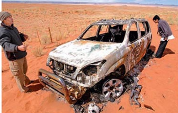
The owner of this Prado – not on our trip – learnt the hard way not to stop a vehicle atop tufts of dry grass.